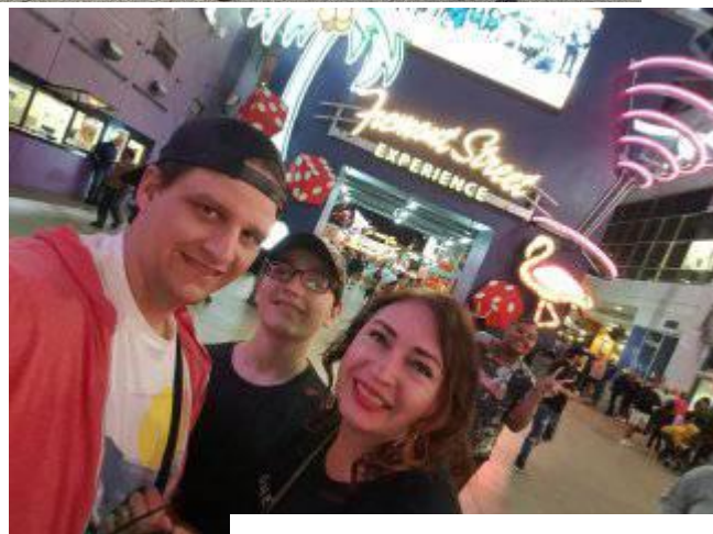
Freemont St, Las Vegas