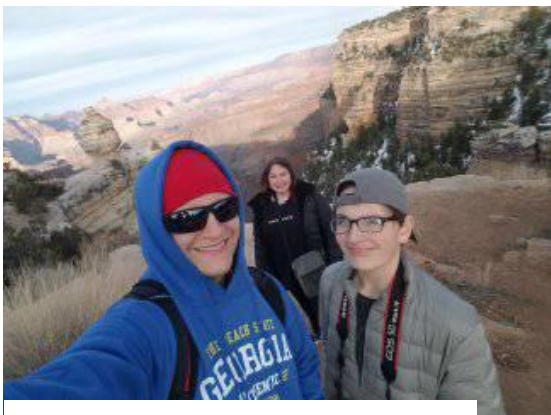
Visiting the Grand Canyon