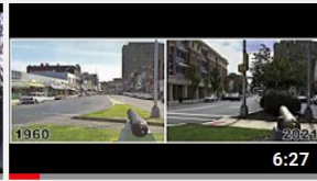
Bloomfield NJ Then Vs. Now 1.8K views • 1 month ago