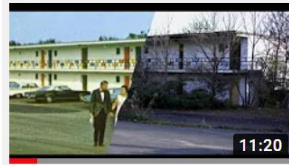
Exploring Abandoned 1960s Resort- Mountain Lake...