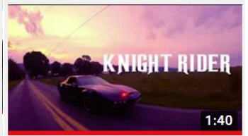
Knight Rider Intro Remake