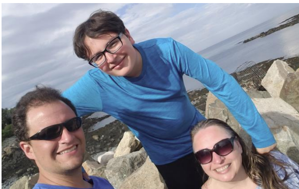
Family trip to Maine earlier this year.